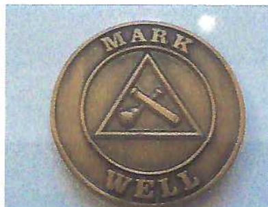
This one is from the Grand Lodge of MMM