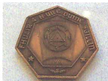
This one shows that Tokens don't have to be round.